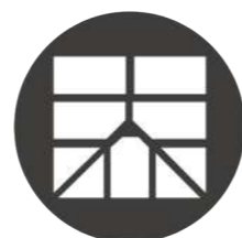
Edwardian or Georgian