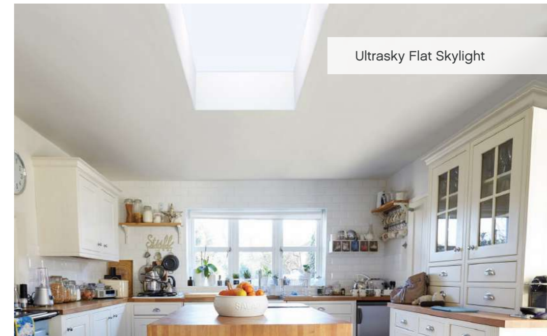
Ultrasky Flat Skylight